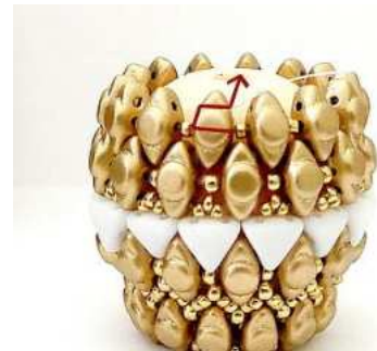
24) Here is the result 😊 Exit HERE through the third hole of the Volos