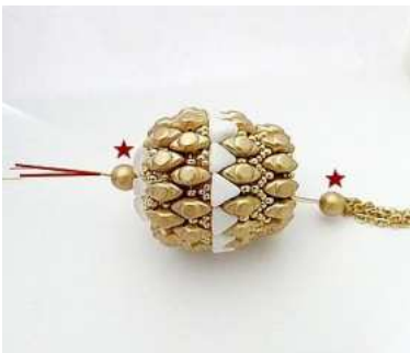
40) Insert 1 RB4 on the two metal wires. Insert Isabelle pearl Isabelle and 1 RB4