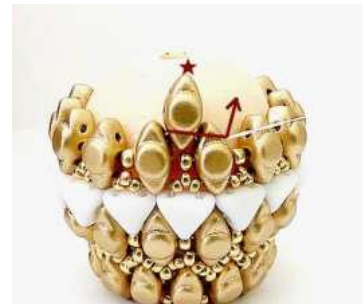
21) Insert 1 Volos between each Volos. All the way around