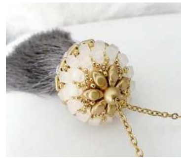
42) For the Necklace, pass a metal thread through a tassel then repeat steps 40 and 41