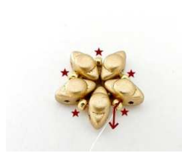
36) Insert 1 SB11 between each Volos