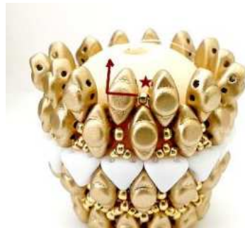
23) Insert 1 SB15 between each Volos