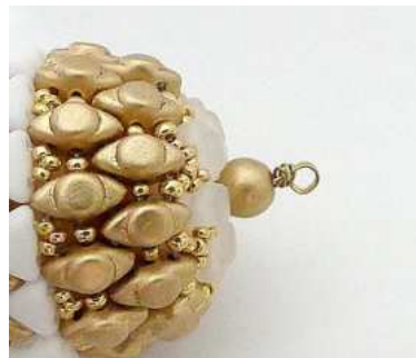
41) Form a ring with the two threads.