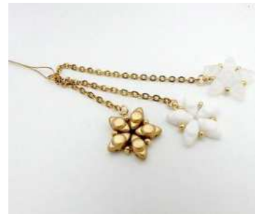
39) Insert three little chains (with 3 different sizes) in a small ring and inside a metal wire bent in two