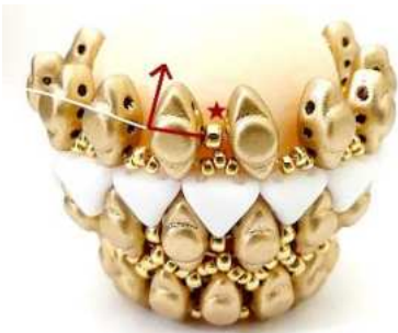
19) Insert 1 SB11 between each Volos 😊