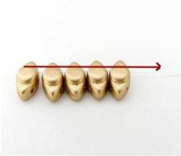
34) Insert 5 Volos 😊