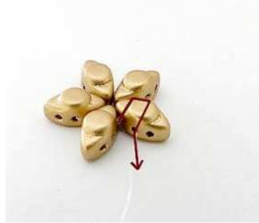
35) Close and exit through the central hole of the Volos