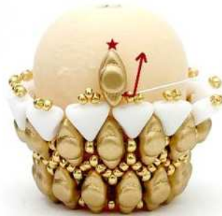
17) Insert 1 Volos through the next SB15. Repeat steps 16 and 17 all the round