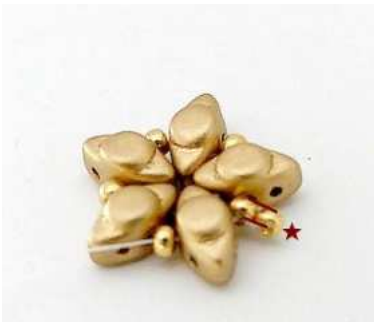
37) Insert 1 SB11 through the same SB11 and reinforce