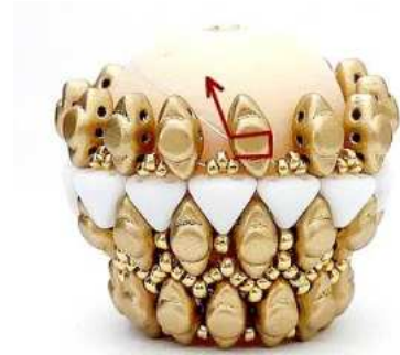
18) Here is the result 😊 Exit through the central hole of the Volos HERE