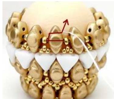
20) Here is the result 😊 Exit through the third hole of the Volos HERE