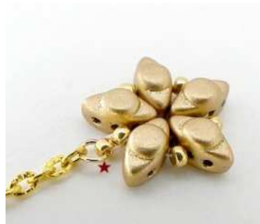
38) Insert 1 jump ring and 1 chain