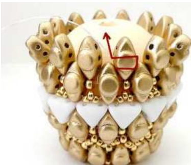
22) Here is the result 😊 Exit through the second hole of the Volos HERE