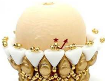
16) Insert 1 SB15 through the SB15